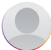
To be announced Hospital Representative